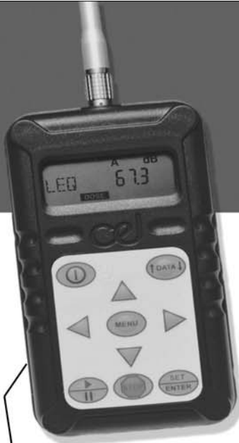
CEL-460 Noise Dosimeter