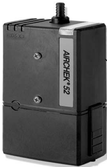
Personal Sampling Pump SKC AirChek 52