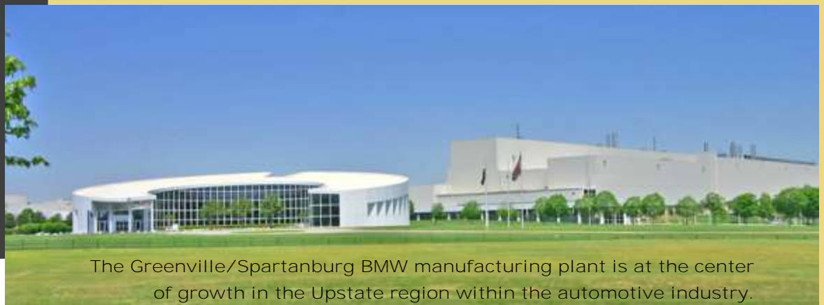
The Greenville/Spartanburg BMW manufacturing plant is at the center of growth in the Upstate region within the automotive industry.